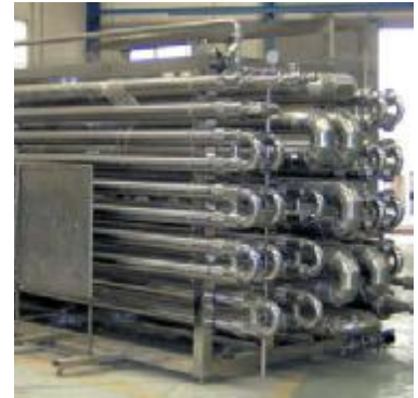
SPIRAFLEX for industrial heat exchangers Narrow bending radii combined with maximum heat exchange, similarly used in industrial applications.