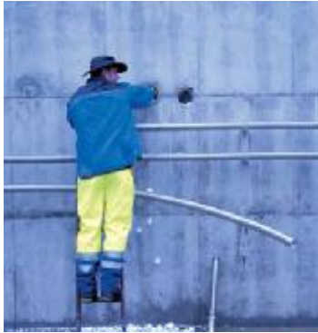
NIROFLEX® for fermenters / biogas plants NIROFLEX®, a version of SPIRAFLEX with stronger material, is used with resounding success in biogas plants.