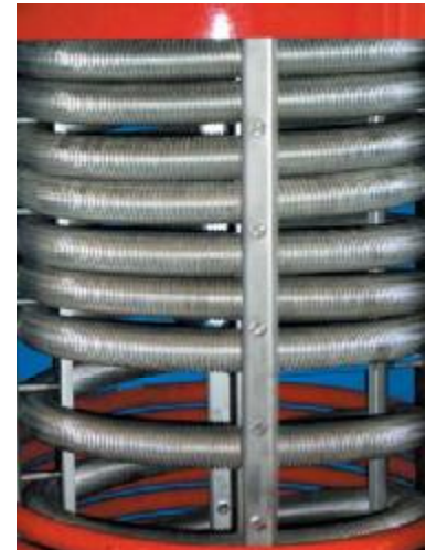
SPIRAFLEX for hot water tanks The optimum use for SPIRAFLEX is in hot water tanks. Thanks to the corrugated profile, hot water tanks can have optimally reduced dimensions.