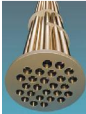
SPIRAFLEX for multityping The all-round pipe is also used in multityping heat exchangers.