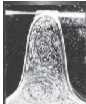
Parallel corrugated pipe: a standing vortex, which forms a dead-water zone