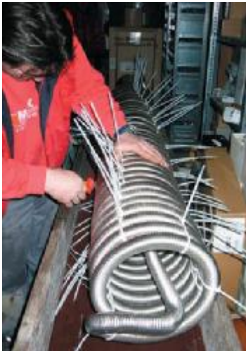
SPIRAFLEX for heat exchangers in wells The simple and flexible installation of SPIRAFLEX is "well-suited" for this purpose.