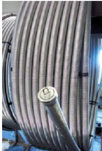
SPIRAFLEX and NIROFLEX® for geothermal applications Various tests have shown that SPIRAFLEX has excellent characteristics for geothermal applications.